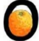
All around the orange