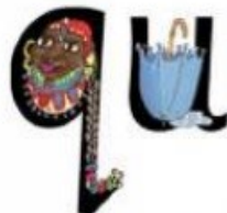
The queen never goes out without her umbrella