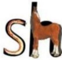
sh says the horse to the hissing snake