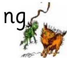
Thing on a string