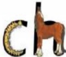
The horse sneezes when the caterpillars hairs get up his nose shush-han