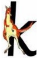
Down the kangaroo's body curl his tail and leg