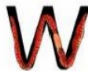
Down up, down up