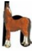
Down the horses head to his hooves and over his back