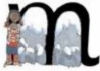
Maisie, mountain, mountain