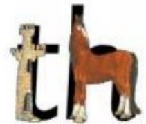
The princess in the tower is saved by the horse, thank you!