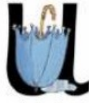
Down and under the umbrella, up to the top and down to the puddle