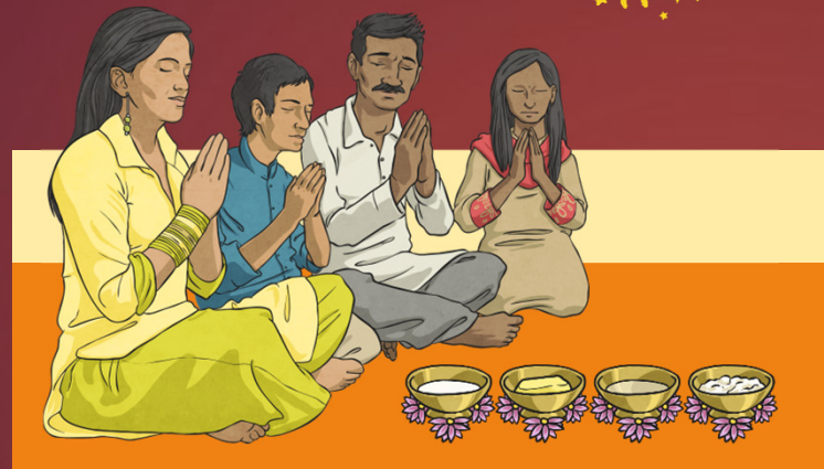
Hindu family praying